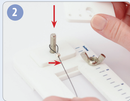
Remove the plate and place the looped wire/cord around the post. Replace the plate.