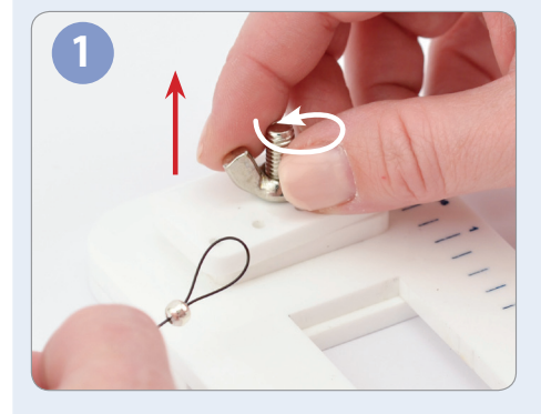
Unscrew the wing nut at the upper part of the Tying Station. Make a loop with your wire/ cord and tie or crimp it.