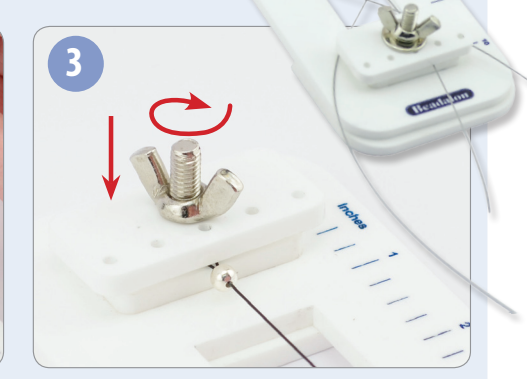
Tighten the wing nut.