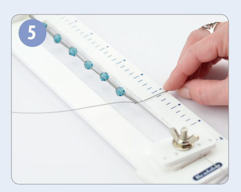
Enjoy the convenience of having both hands available to design intricate jewelry, such as Shamballa Style and Wrap Bracelets.