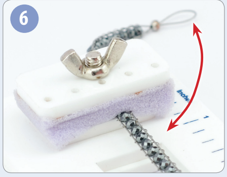
Tip: If your design is longer than the Tying Station, simply remove the upper plate and add the foam pad. Pull your design through and gently tighten the wing nut to continue working on your jewelry piece.